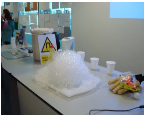
Ice cream mixture having had liquid nitrogen poured over it forms a frozen foam block. This was at a demonstration of cryogenics.

The Hankerton History Group visited the National Physical Laboratory in May 2014. Six members of the group took the opportunity to join with the Cirencester Science and Technology Society to visit the NPL biannual 'Open Day' at its Teddington laboratories. The primary aim of the NPL is to develop more and more accurate means of measuring physical attributes. They take care of the British copy of the International standards upon which all our measuring is based. This is the standards for length such as the metre, for weight such as the kilogramme, for time the Caesium clock, for radio and other frequencies, for gases of all kinds and so we go on in to materials, acoustics, computers, mathematics, green house gases, pollution, and even the universe. Some 25 laboratories were open to us visit and talk with scientists, most of which covered aspects of research at the cutting edge of science. Some of the subjects were of quite extraordinary range such as isolating a single electron and then close to it observing the earth and then applications for medical ultrasound.