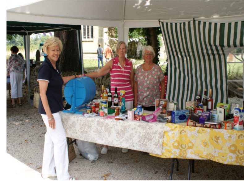
And here we have some happy villagers and stall Holders - didn't they all do well!!