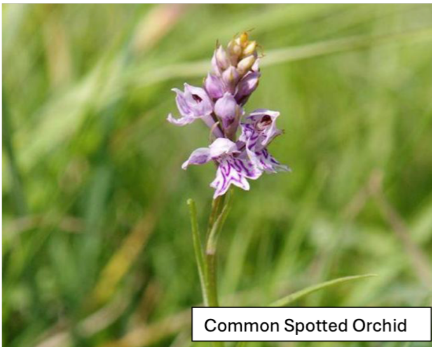
Common Spotted Orchid

I understand that it takes about 7 years for the seed of the Bee Orchid to grow into a plant strong enough to produce a flower. If you were to sow seed of the Bee Orchid in your lawn you would have to have patience, and hope that the correct fungal network is present to allow it to germinate and grow.